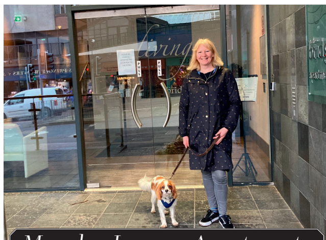
Mansley Luxury Apartments

Everything has been thought of, with a setup which suits relaxing, hosting or adventuring. In keeping with high standards across the property, the modern kitchen is very well appointed. Kids (or adults) could happily hide away in the upstairs snug with movies and games. A substantial heated utility room and separate bike shed mean you are covered for outdoor activities too. As for bedrooms, we were spoiled for choice. All bedrooms are stylish and inviting with sumptuous furnishings. Just a short drive from Aviemore, you're well placed to enjoy a range of activities. Our visit to the Cairngorm Reindeer Centre was a highlight, and we'd love to come back during the snowsports season. Tom's Lodge is your perfect base.